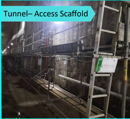
Tunnel- Access Scaffold